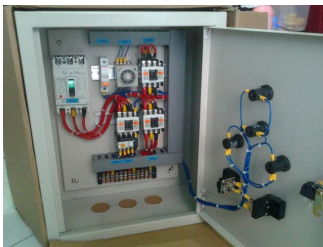
Figure 3 Star-delta control system circuit (Y-Δ)