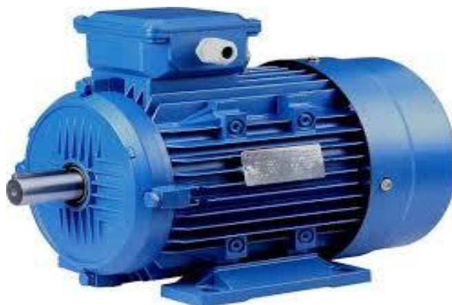
figure 1 Phase Electric Motor

Typically, 3-phase electric motors use a voltage of 380-415 volts. This is the optimal voltage to produce large enough and efficient power in the motor.